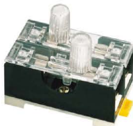
DVFS-102 6X30 2P