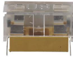
DVBF-015(PCB) \Phi 5X20