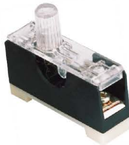
DVFS-101 6X30 1P