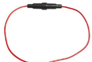
DVF103-C1 \Phi 5X20