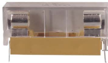
DVBF-106(PCB) \Phi 6X30